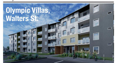
Olympic Villas, Walters St.